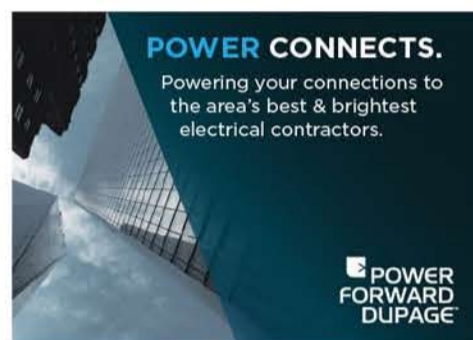
Block ad is 420w x 300h pixels