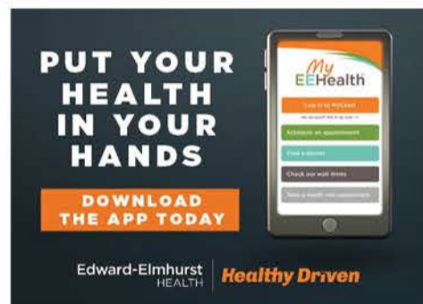
Block ad is 420w x 300h pixels